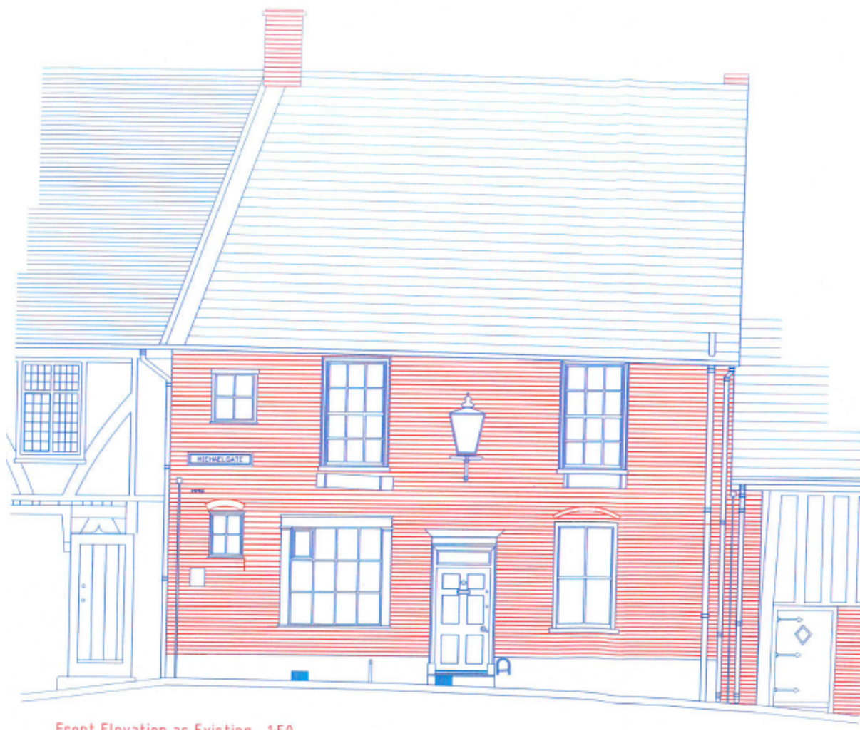
Existing front, north elevation