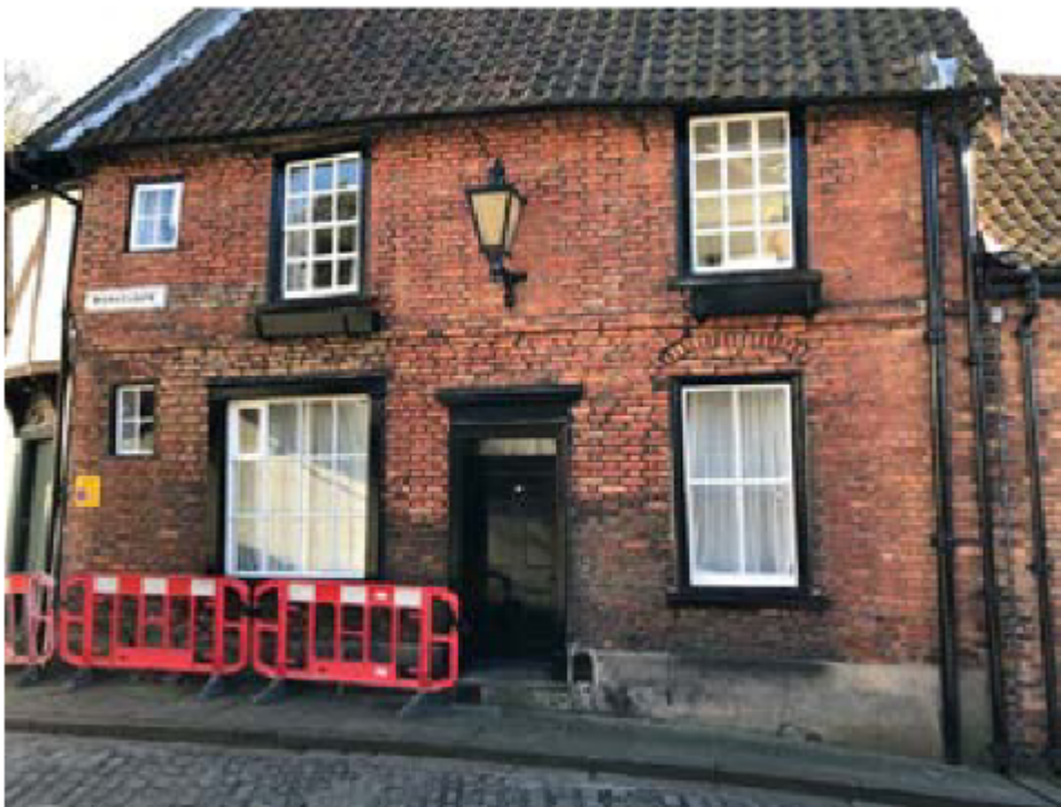
Photos showing external and internal damage